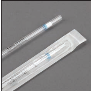
1740 - Sterile, individually wrapped