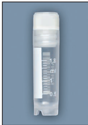
Item# 3002 (shown actual size)