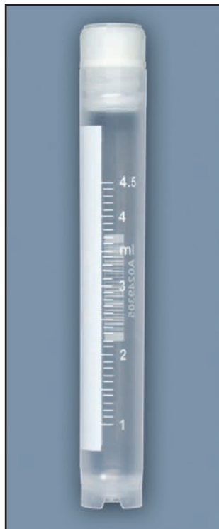
Item# 3008 (shown actual size)

All CryoClear™ cryogenic vials are sold in tamper evident, resealable plastic bags. 50 vials per bag, 10 bags per case.