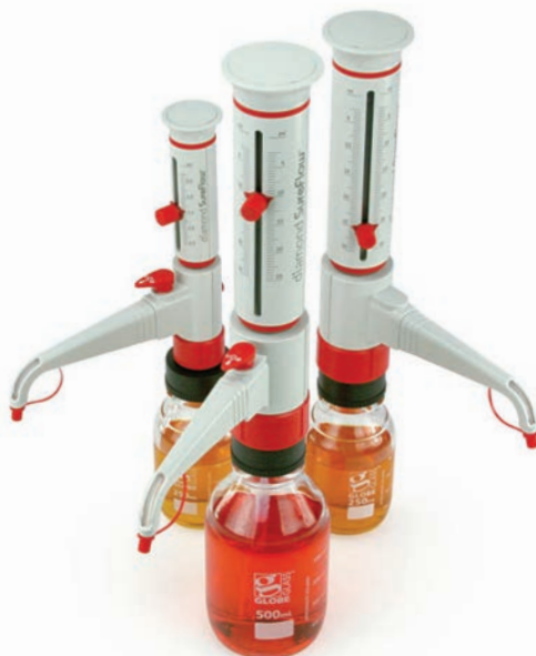
Large dispenser tube window display