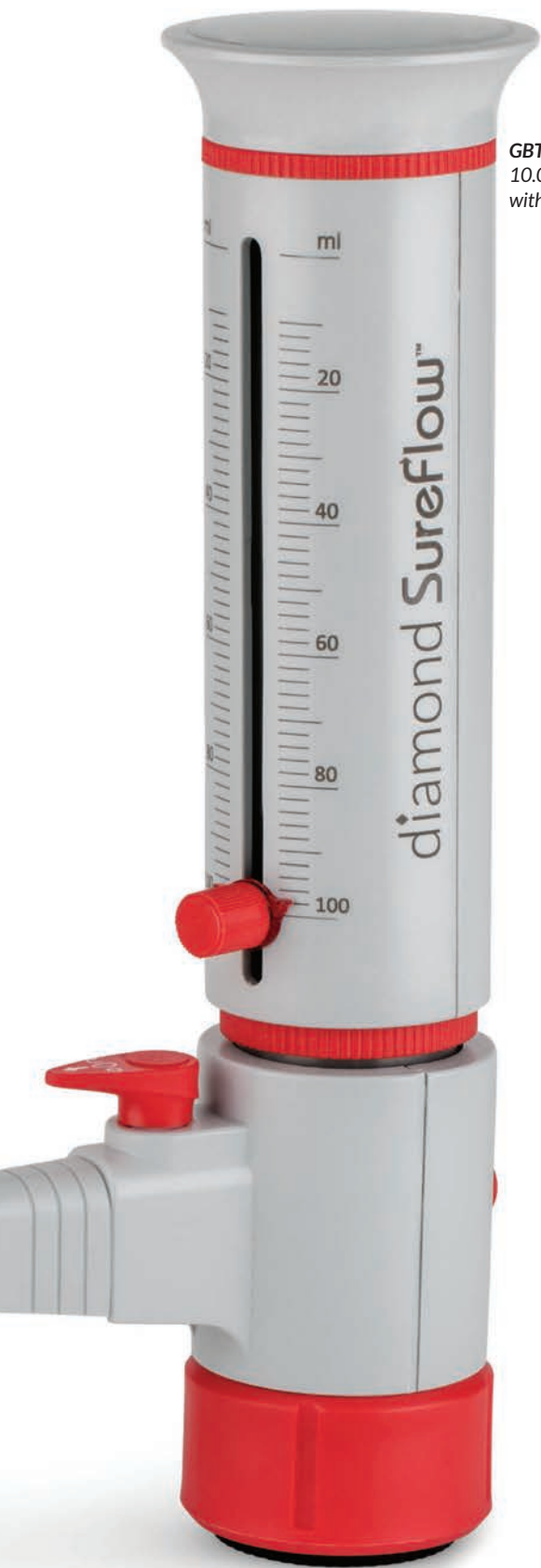
GBTD-R-100 – 10.0mL to 100.0mL with recirculating valve