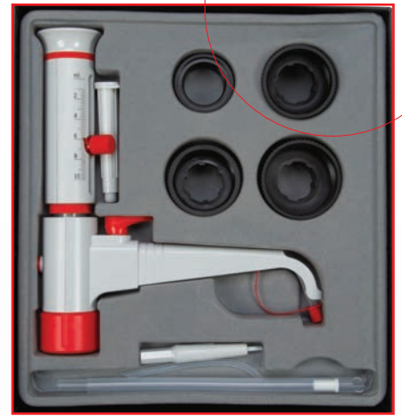
Each Diamond® SureFlow™ package includes: Bottle top dispenser, 4 threaded bottle adapters, telescopic fill tube & calibration tool