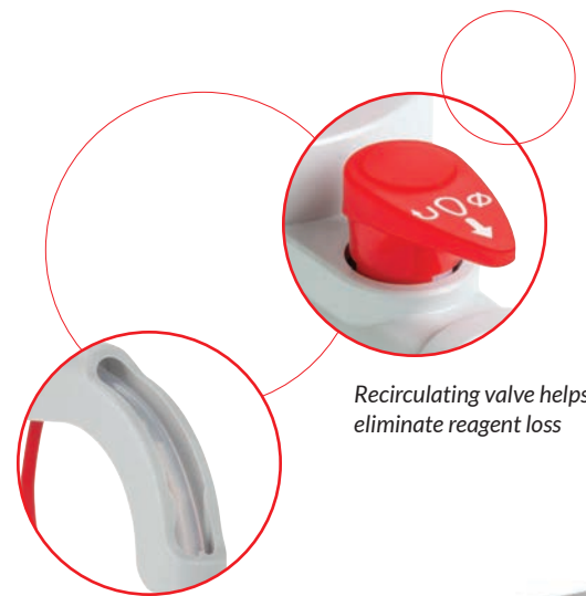
Recirculating valve helps eliminate reagent loss