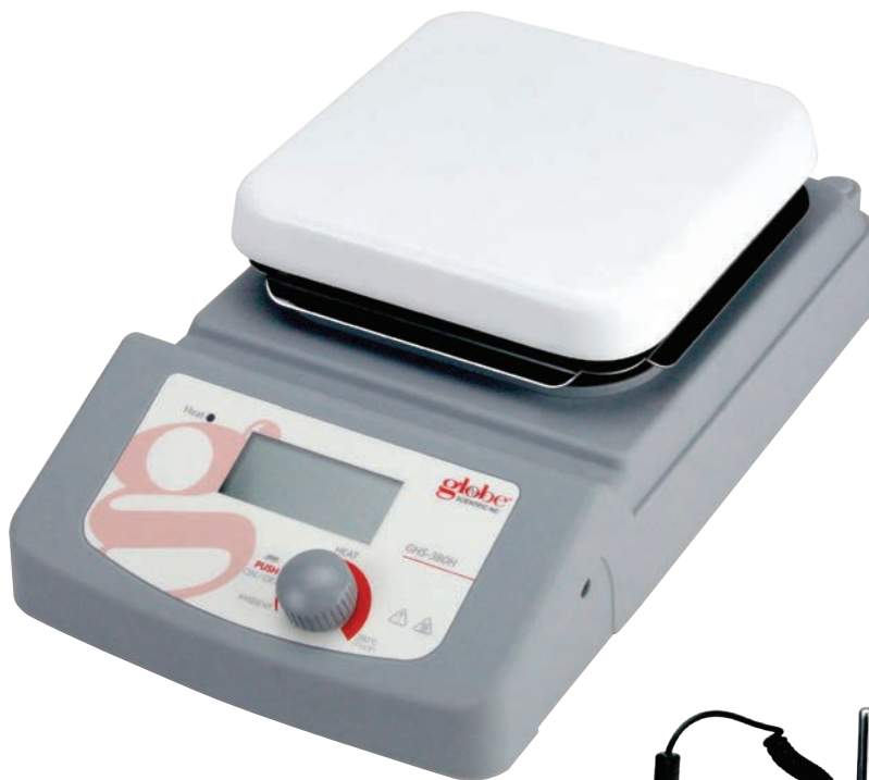
GHS-380H with optional temperature sensor and support stand installed.