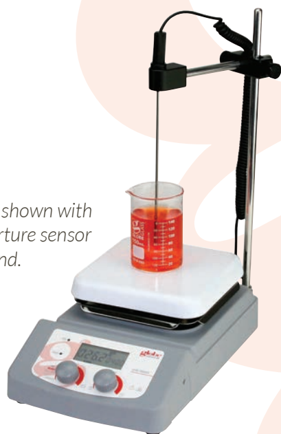
GHS-380HS Hotplate Stirrer shown with optional temperature sensor and support stand.

The GHS-380 group of Hotplates, Magnetic Stirrers and Magnetic Stirrer Hotplates are reliable and easy to use. The low profile and small footprint save valuable workspace. The chemical resistant ceramic-coated 5.5-inch square work surface is easy to clean and ensures years of service.