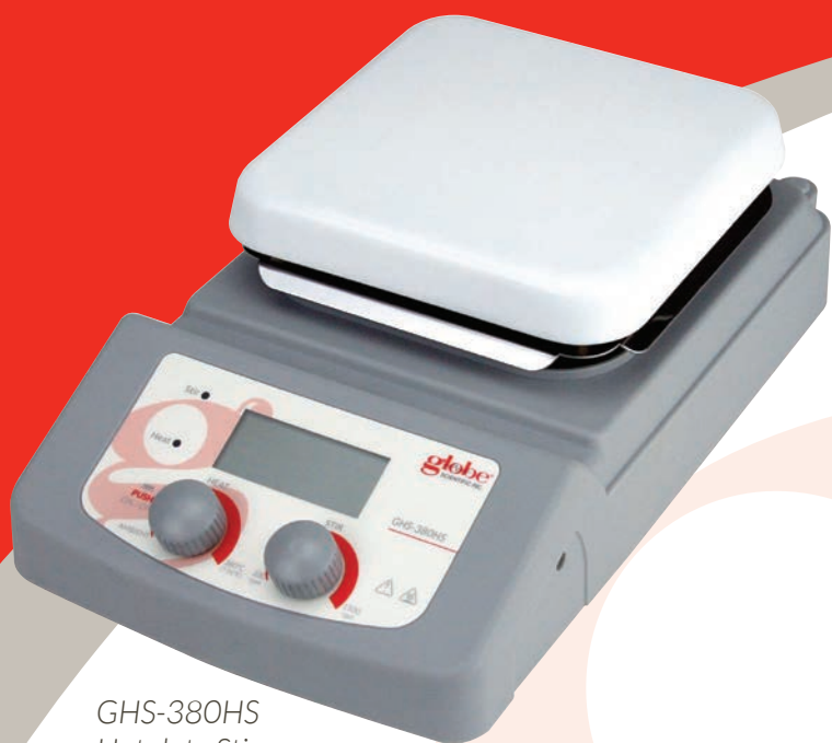
GHS-380HS Hotplate Stirrer