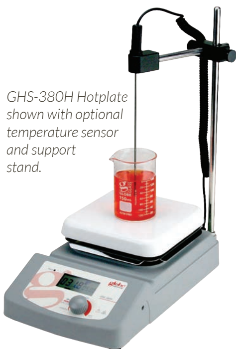
GHS-380H Hotplate shown with optional temperature sensor and support stand.

All GHS-380 Series units feature a 5.5" square, chemical resistant ceramic-coated work surface.