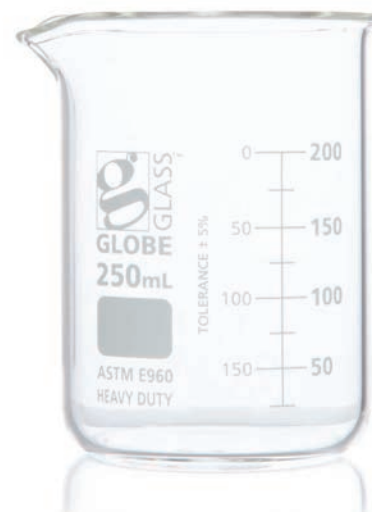
Heavy duty Griffin style beakers available in 6 sizes.