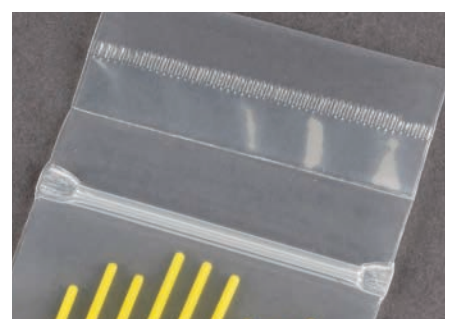
Packaged in resealable, tamper-evident bags