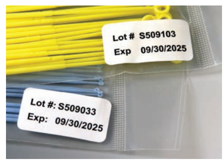
Each bag is individually labeled with lot number and expiration date